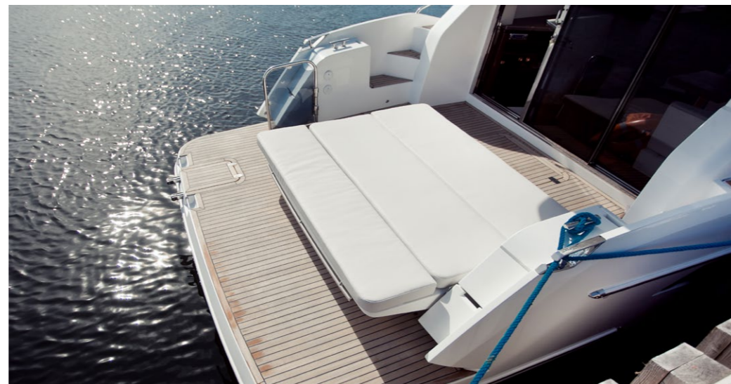
Cockpit seating turned into a sundeck