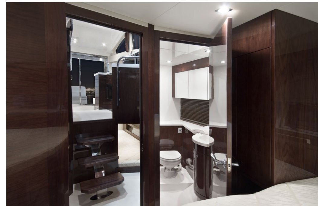
Up to three cabins down below