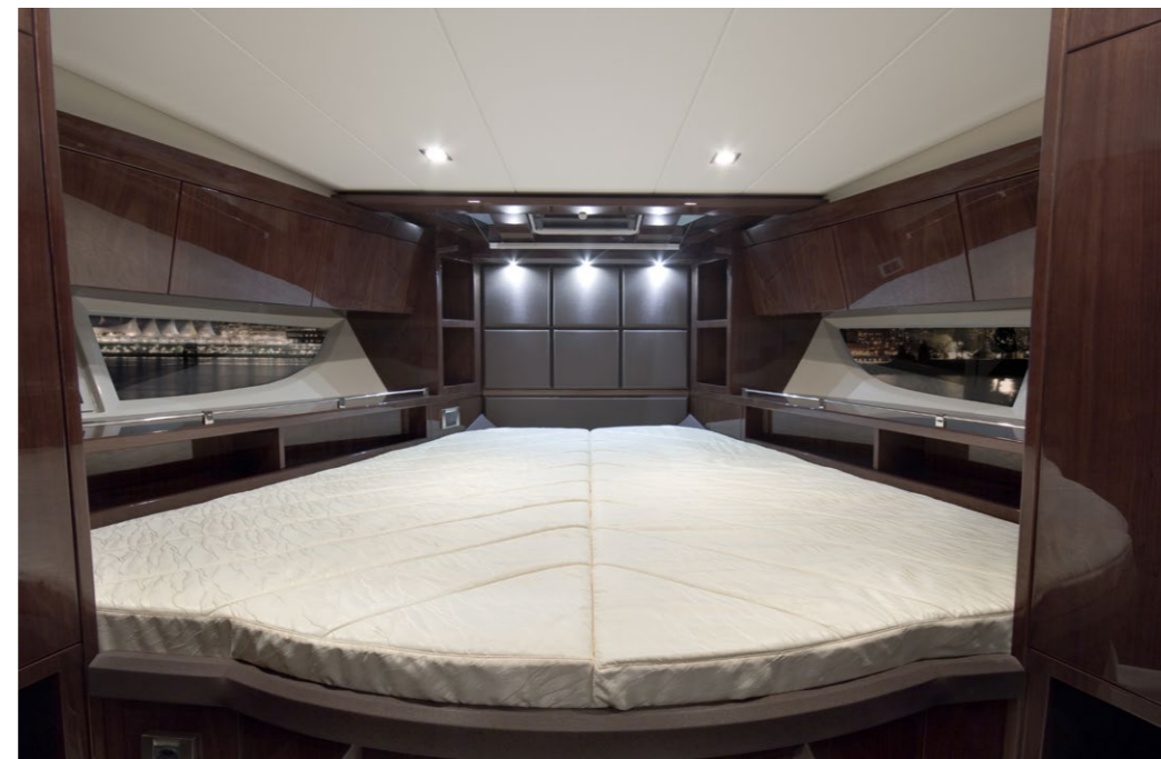
The owner's quarters