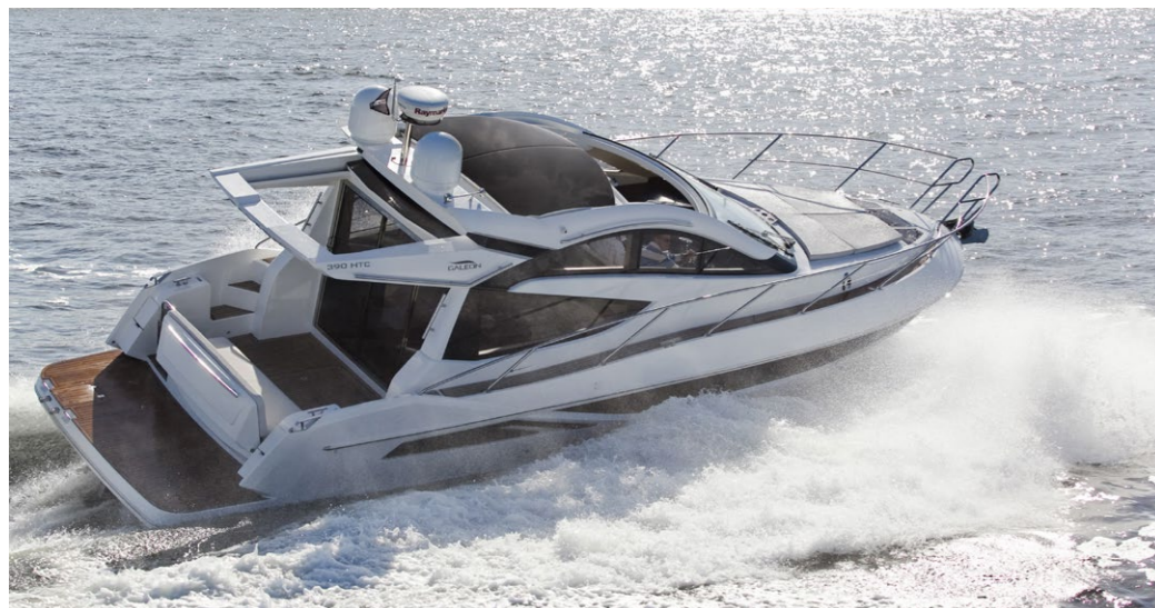
The roof over the cockpit is retractable