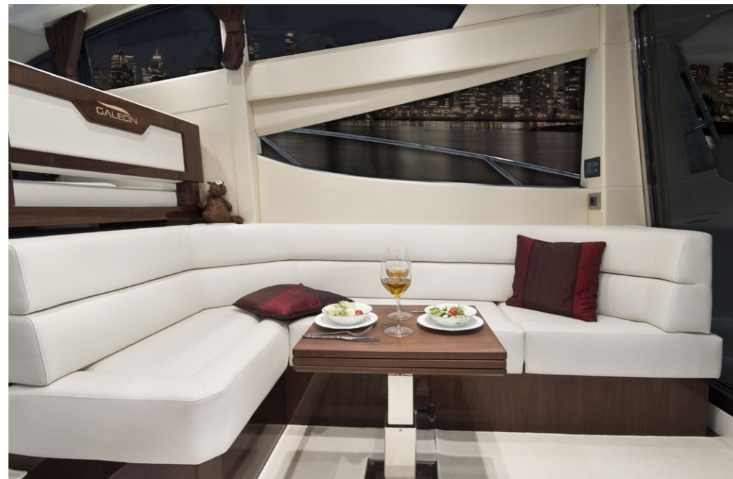
The dinette is moved back