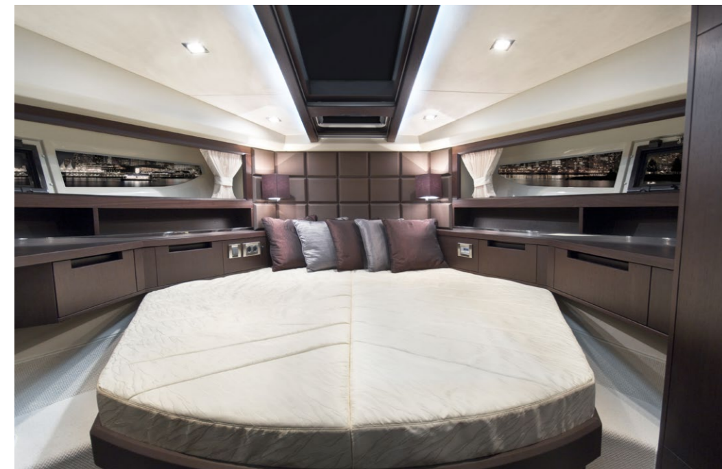
Bow cabin with plenty of extra storage