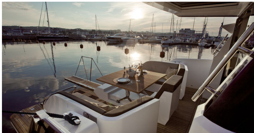
Transformable cockpit seating