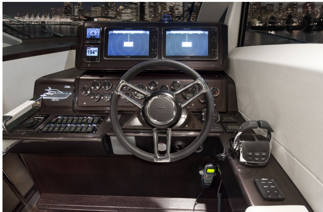
The yacht's command centre