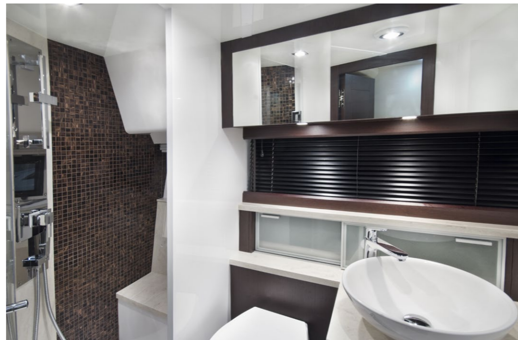
One of two bathrooms located down below