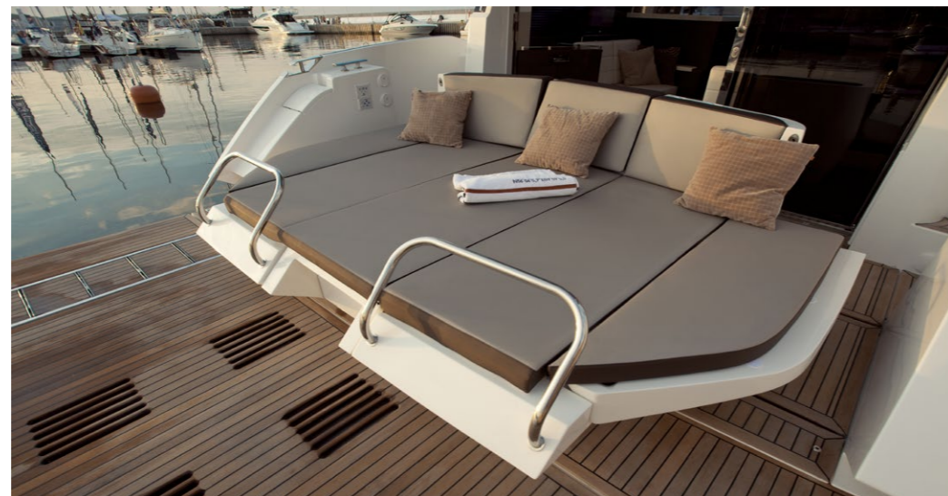
The cockpit settee can be turned into a sundeck