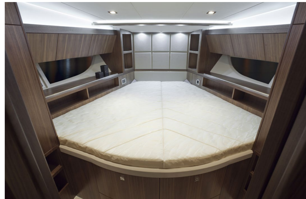
Forward owner's cabin