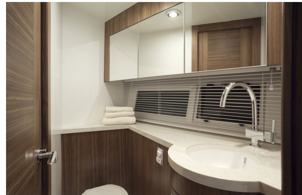
Separate head and shower down below