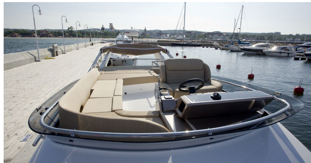
The sizable flybridge of the 380 Fly