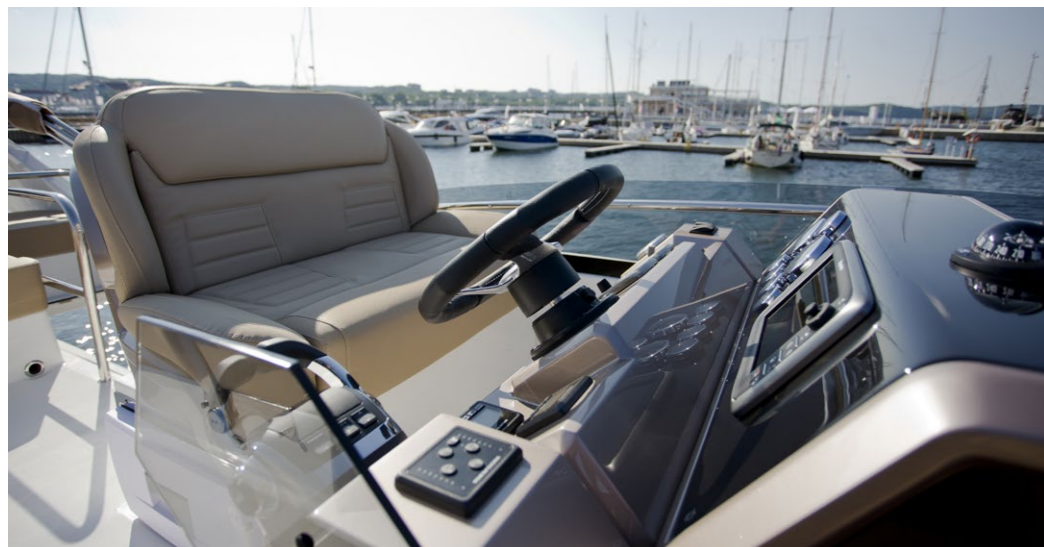
Double seat at the top steering station