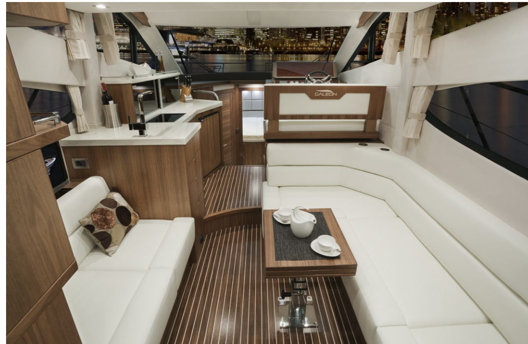
A galley, dinette and helm station can be found in the saloon