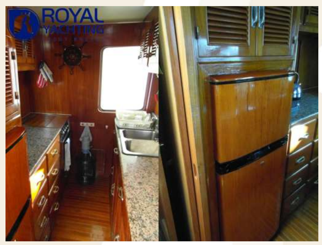
Keep your mind free, www.royalyachting.ae