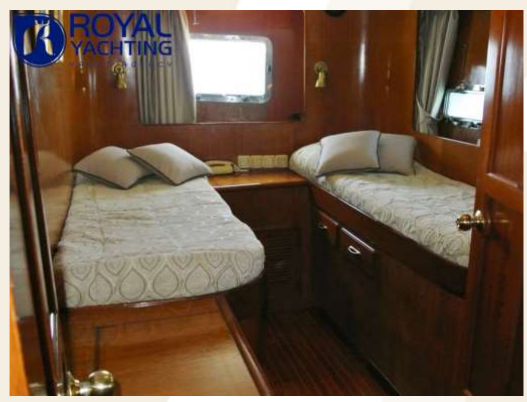
Keep your mind free. www.royalyachting.ac