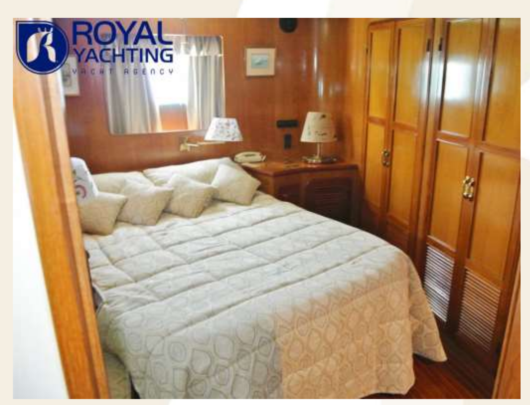
Keep your mind free. www.royalyachting.ac