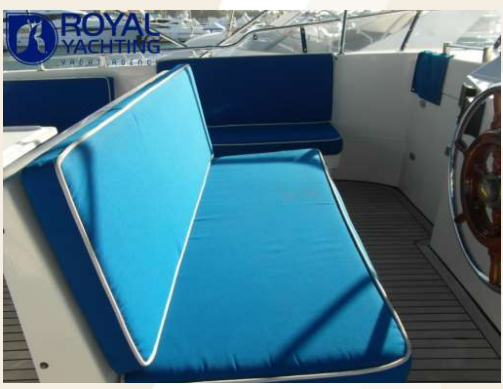
Keep your mind free, www.royalyachting.ae