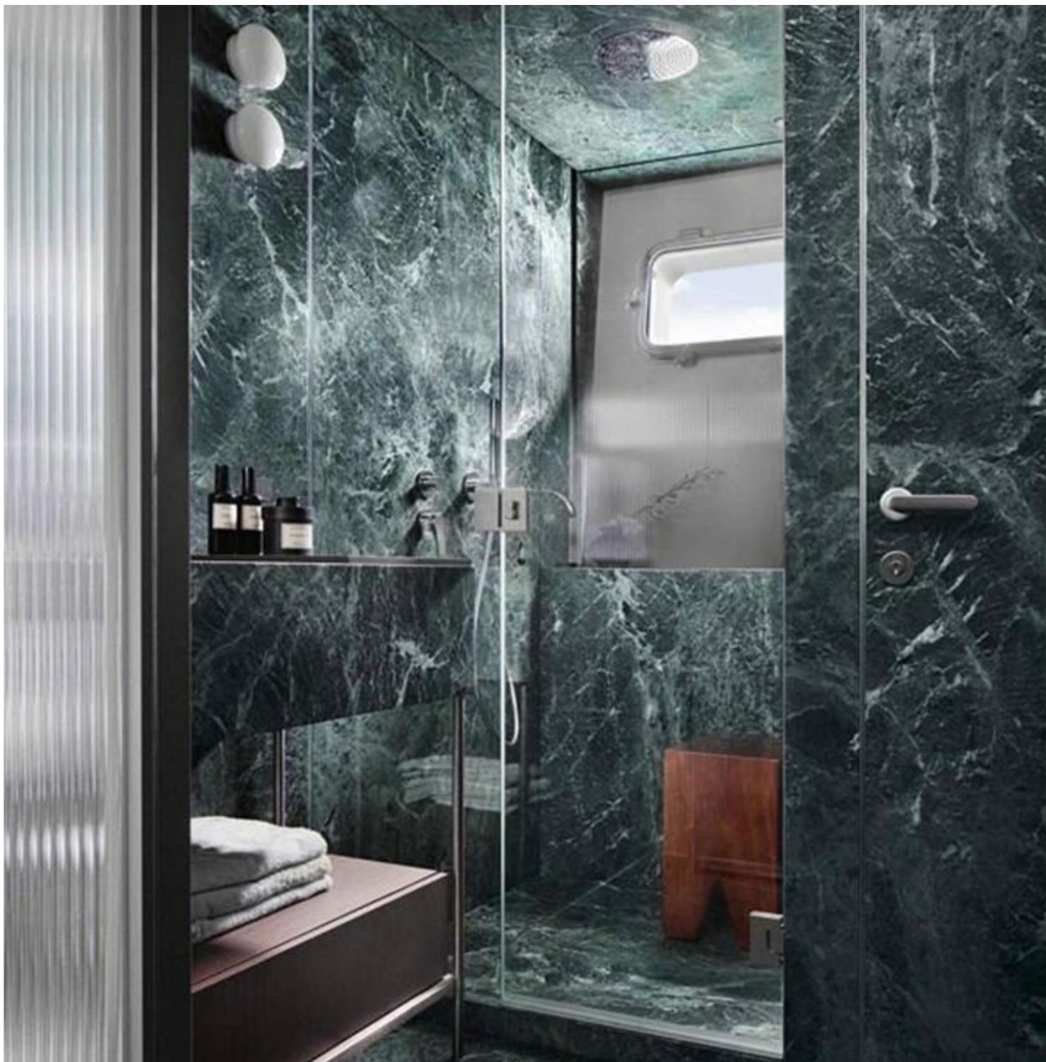
*This photograph is not the actual boat, for illustration purposes only.*