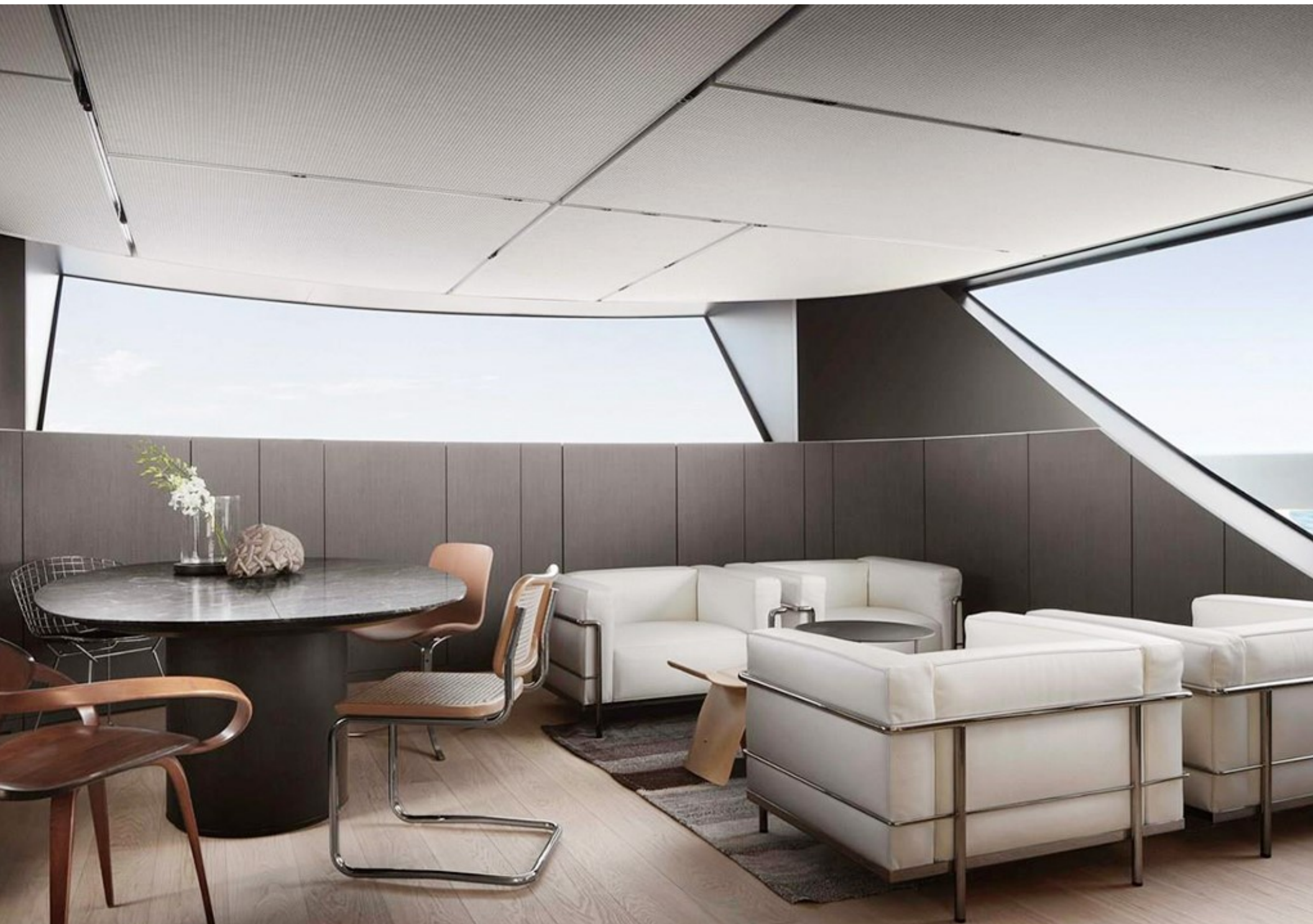
*THIS PHOTOGRAPH IS NOT THE ACTUAL BOAT , FOR ILLUSTRATION PURPOSES ONLY*