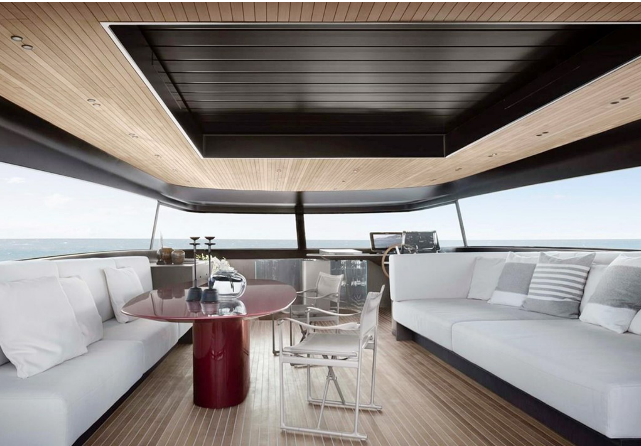
*THIS PHOTOGRAPH IS NOT THE ACTUAL BOAT , FOR ILLUSTRATION PURPOSES ONLY*