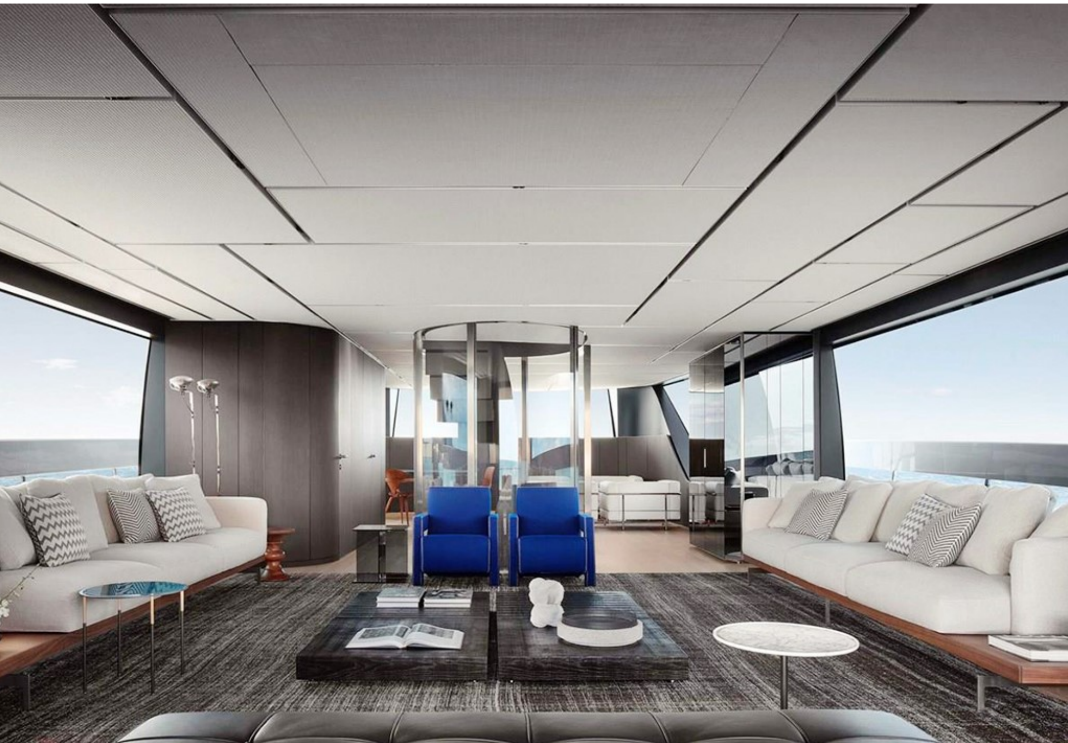
*THIS PHOTOGRAPH IS NOT THE ACTUAL BOAT , FOR ILLUSTRATION PURPOSES ONLY*