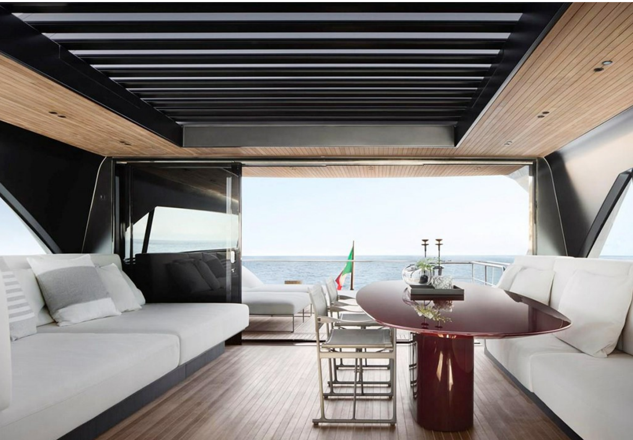
*THIS PHOTOGRAPH IS NOT THE ACTUAL BOAT , FOR ILLUSTRATION PURPOSES ONLY*