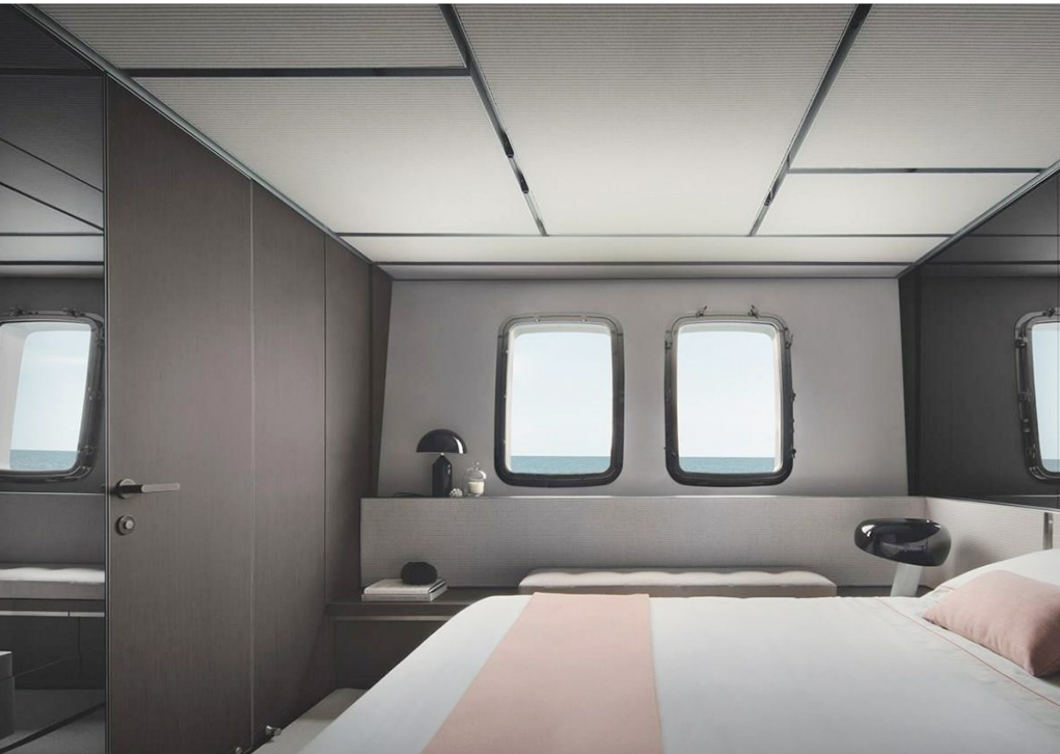
*This photograph is not the actual boat, for illustration purposes only.*