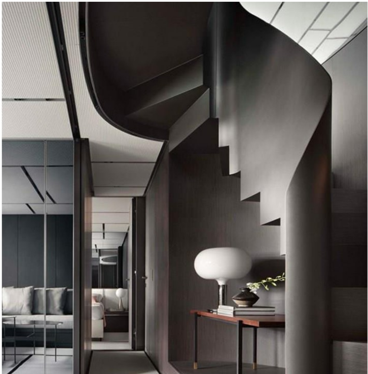
*This photograph is not the actual boat, for illustration purposes only.*