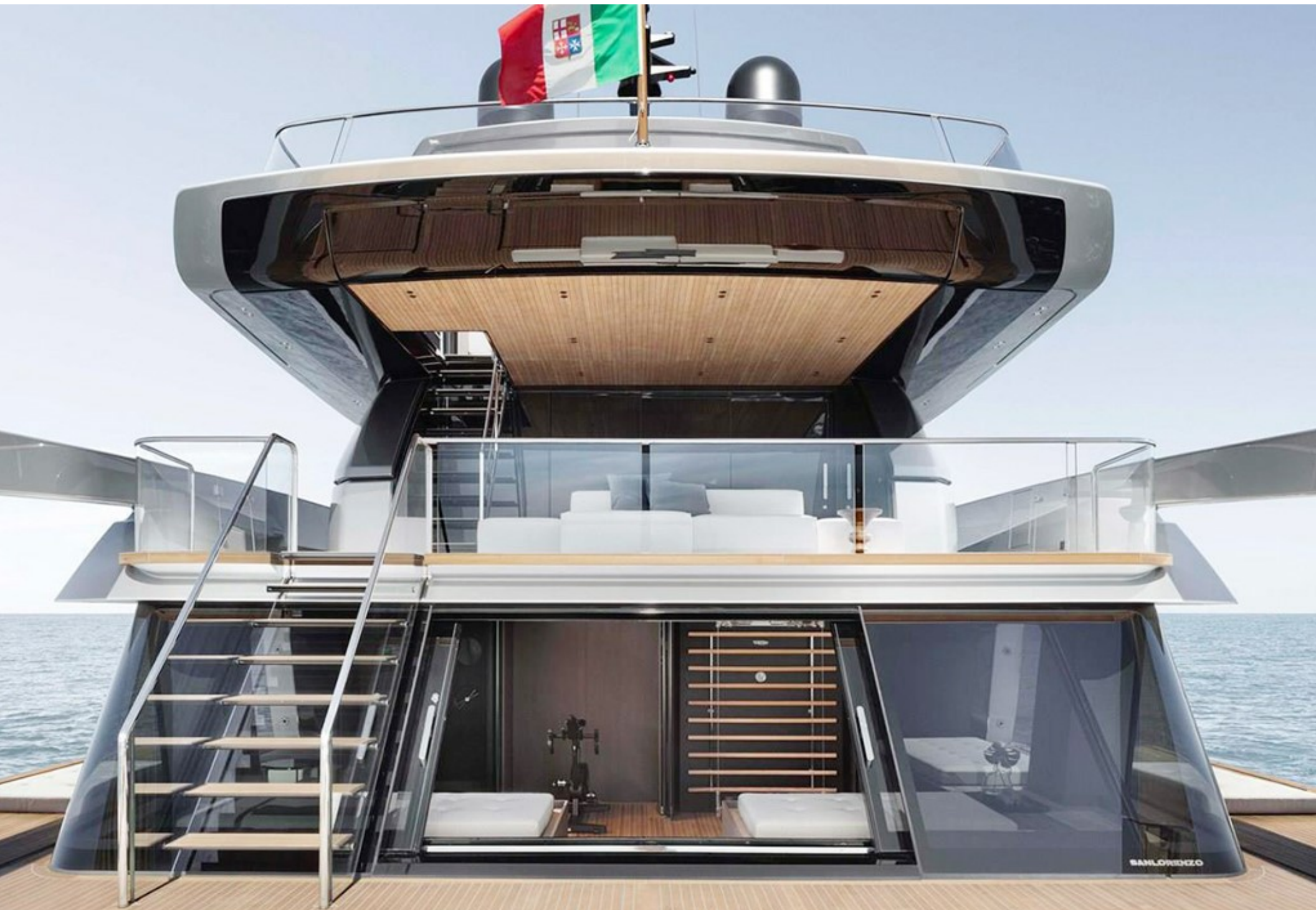
*THIS PHOTOGRAPH IS NOT THE ACTUAL BOAT , FOR ILLUSTRATION PURPOSES ONLY*