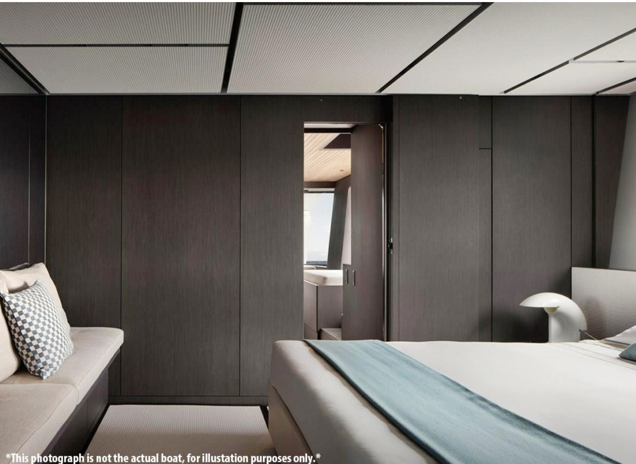
*This photograph is not the actual boat, for illustration purposes only.*