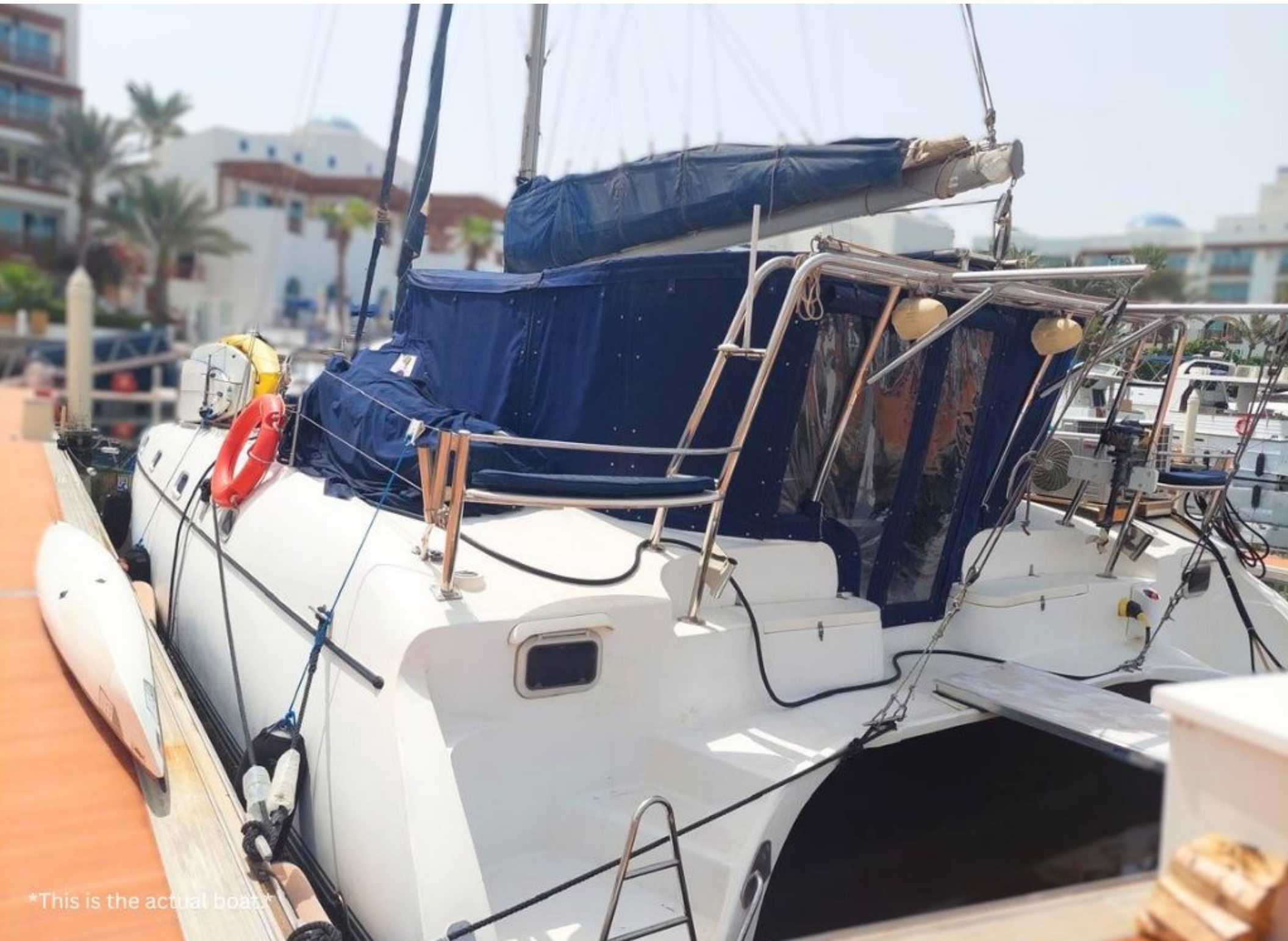
*This is the actual boat.*