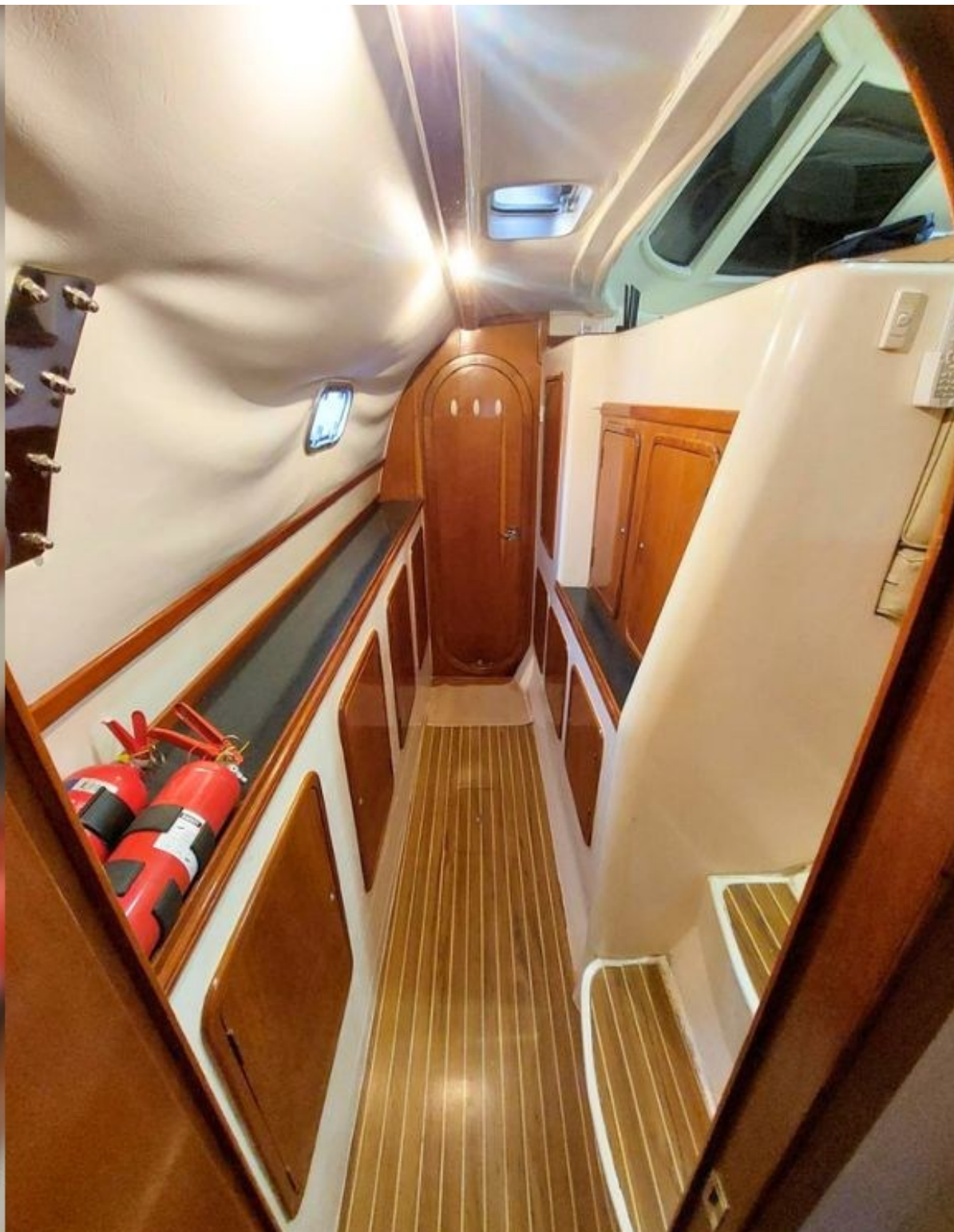
*This is the actual boat.*