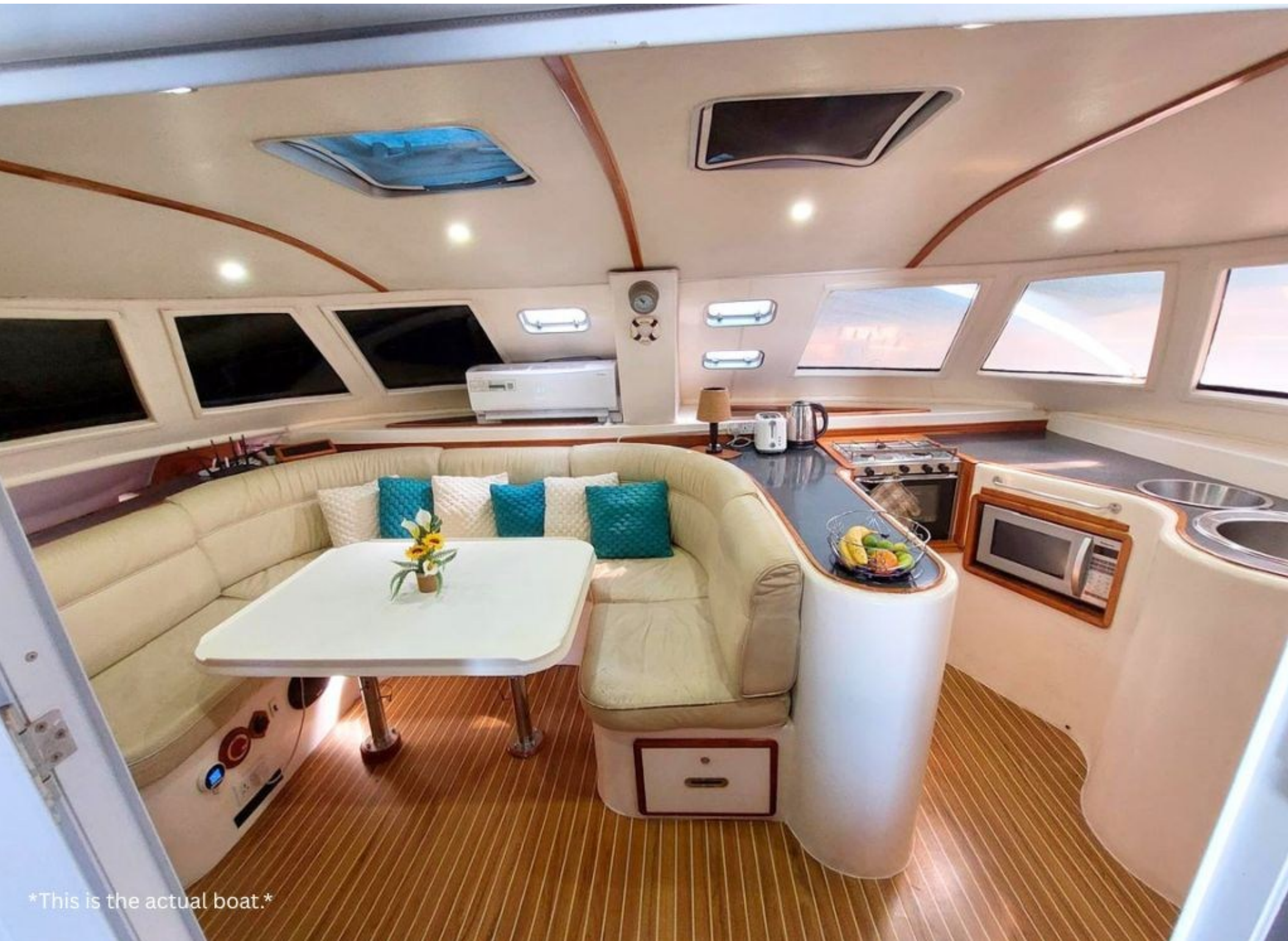
*This is the actual boat.*