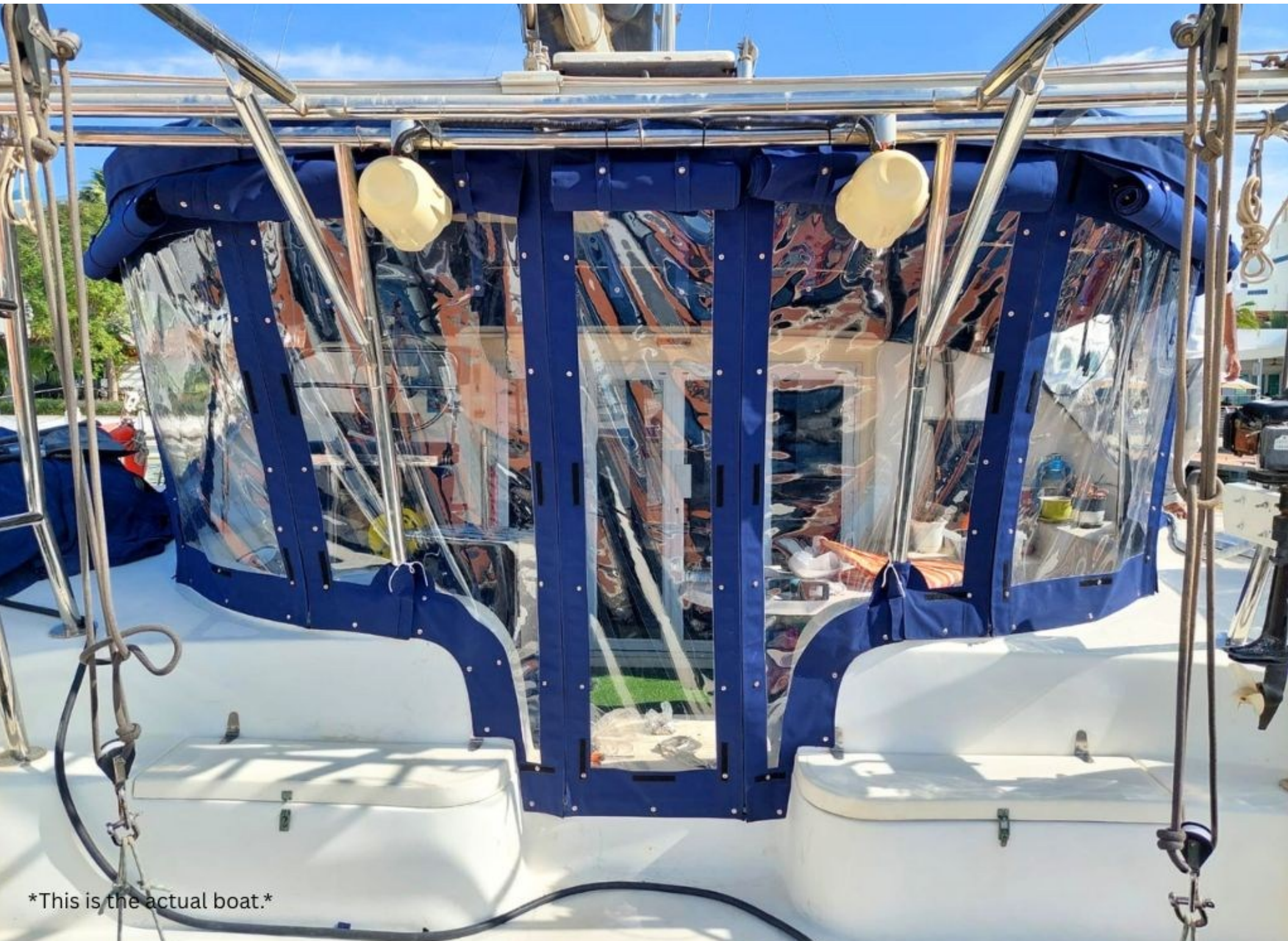
*This is the actual boat.*