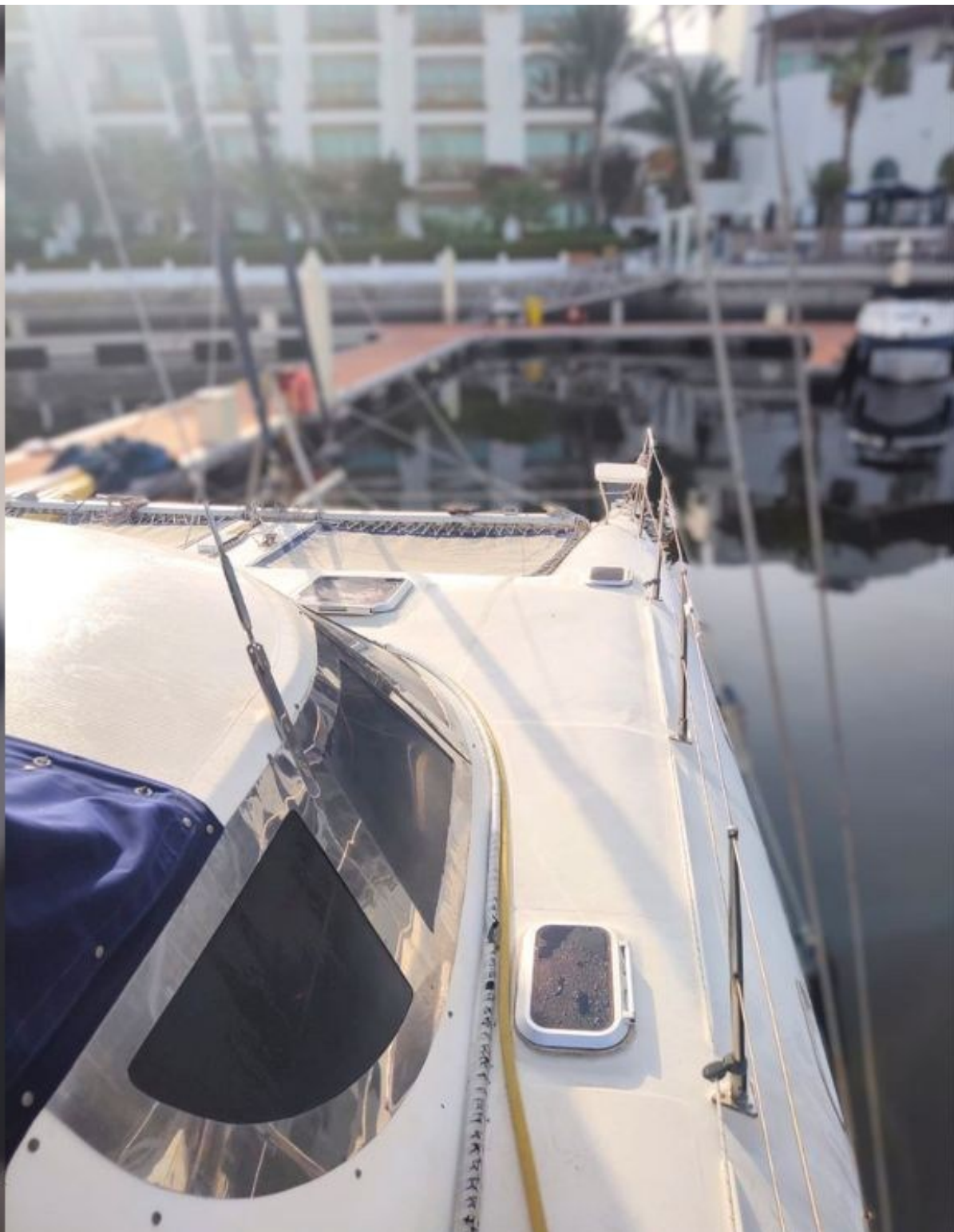
*This is the actual boat.*