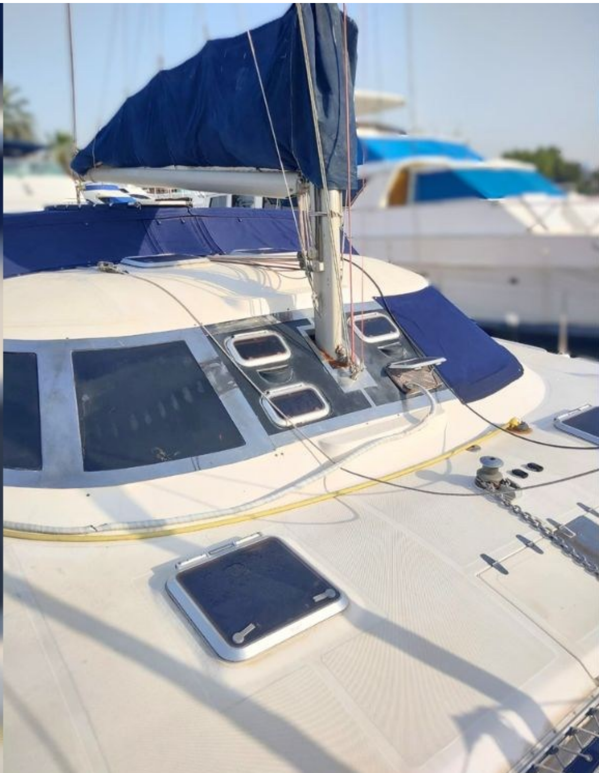
*This is the actual boat.*