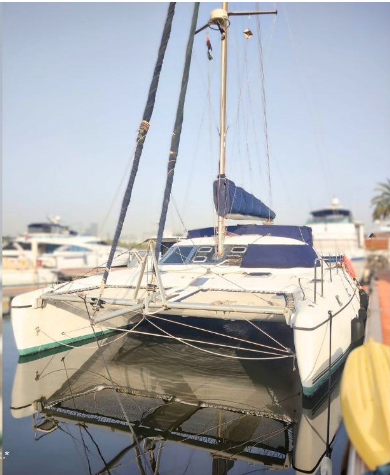
*This is the actual boat.*