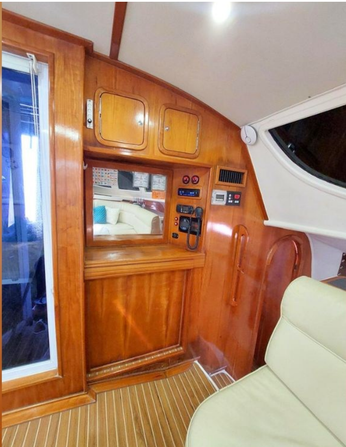
*This is the actual boat.*