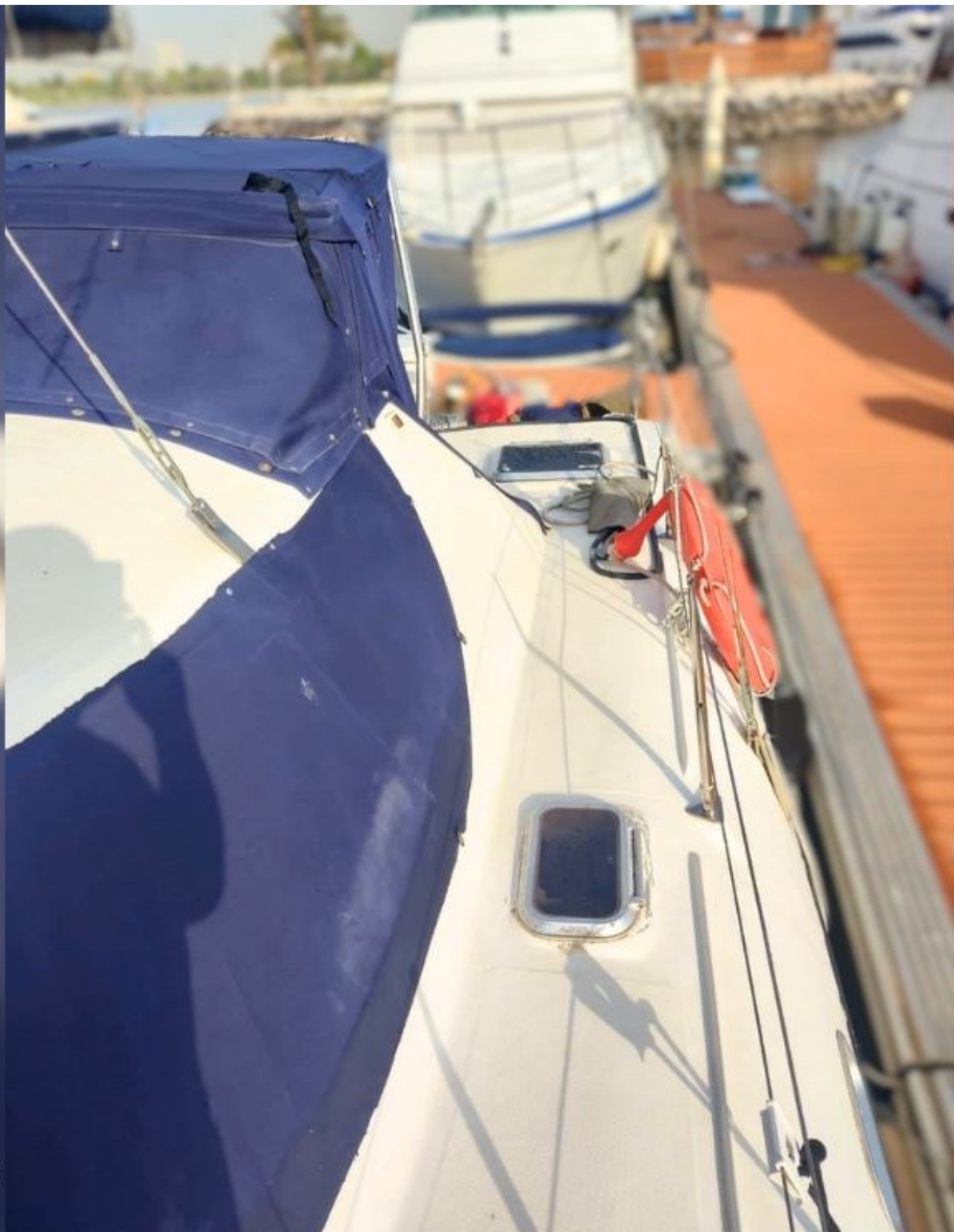
*This is the actual boat.*