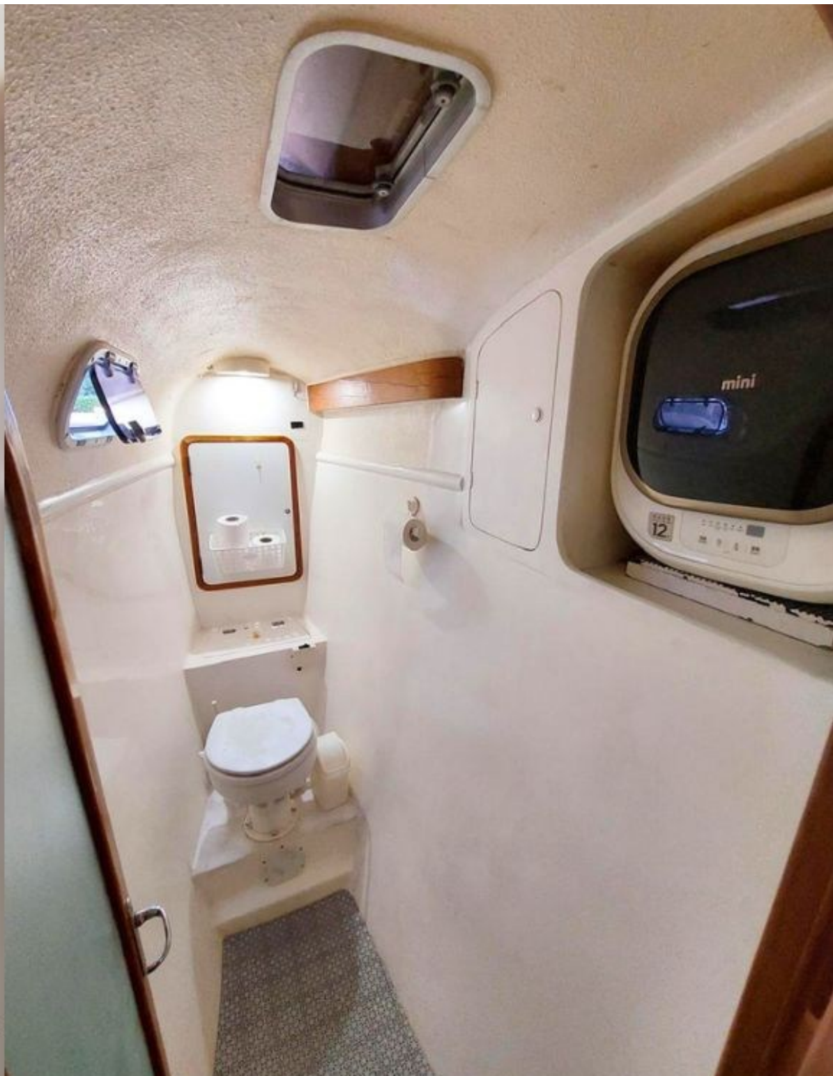
*This is the actual boat.*