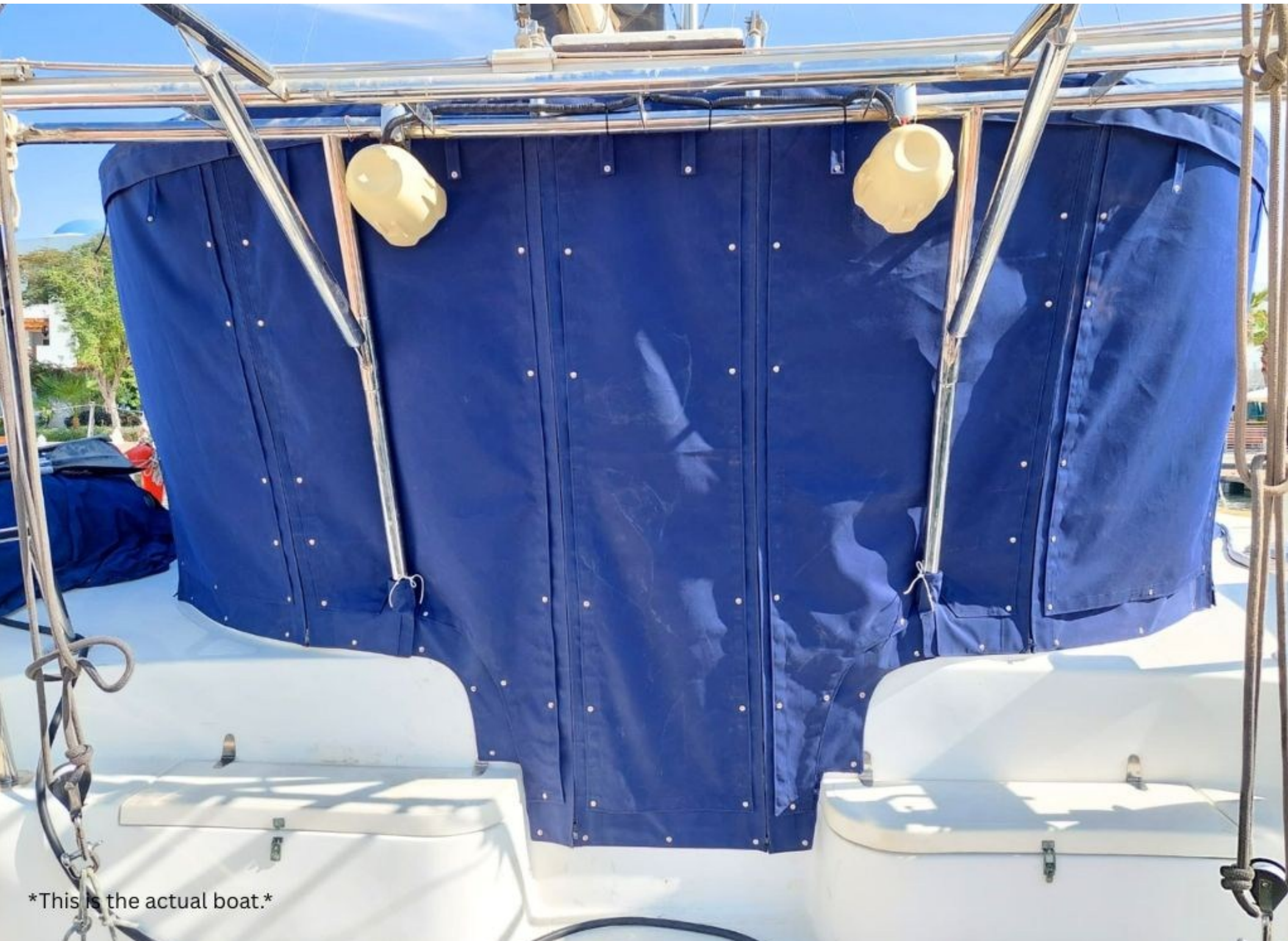
*This is the actual boat.*