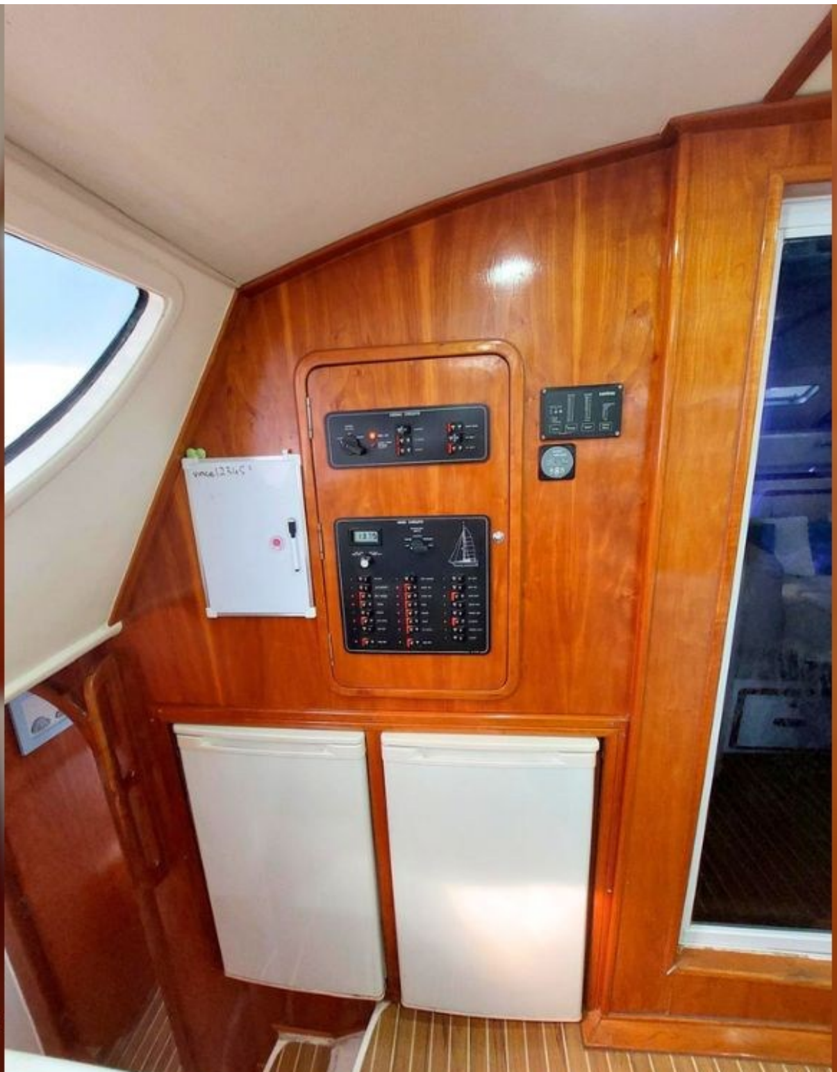
*This is the actual boat.*