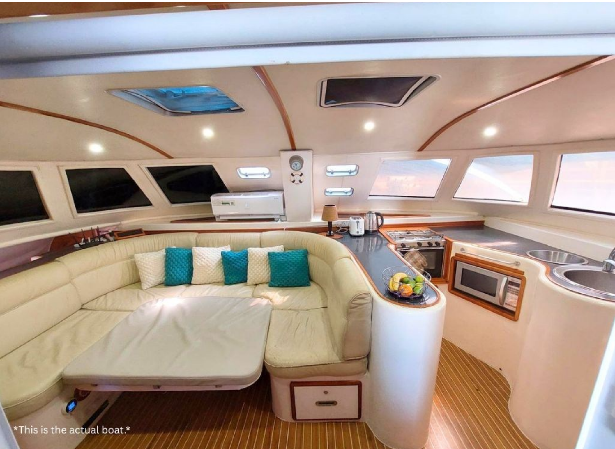
*This is the actual boat.*