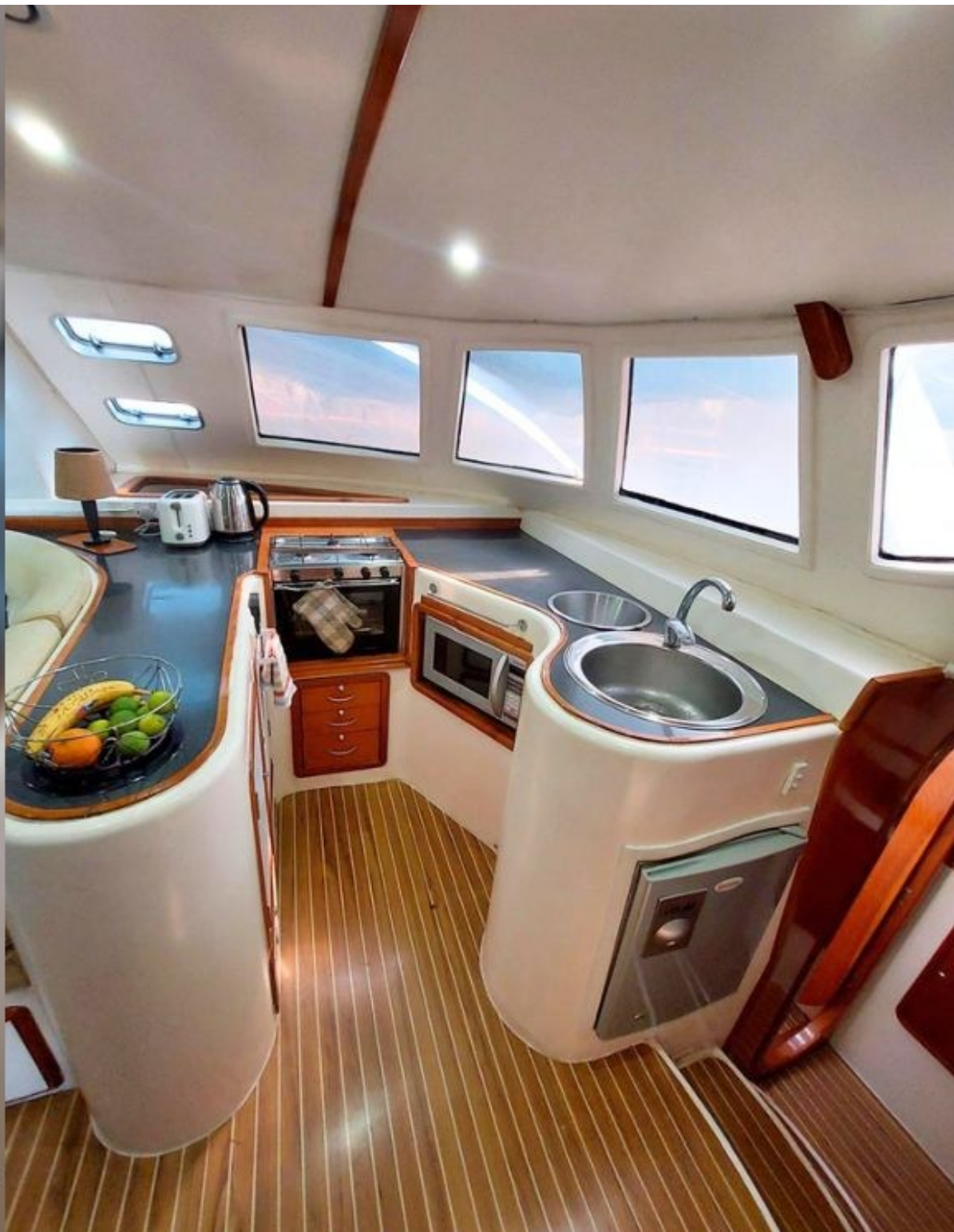
*This is the actual boat.*