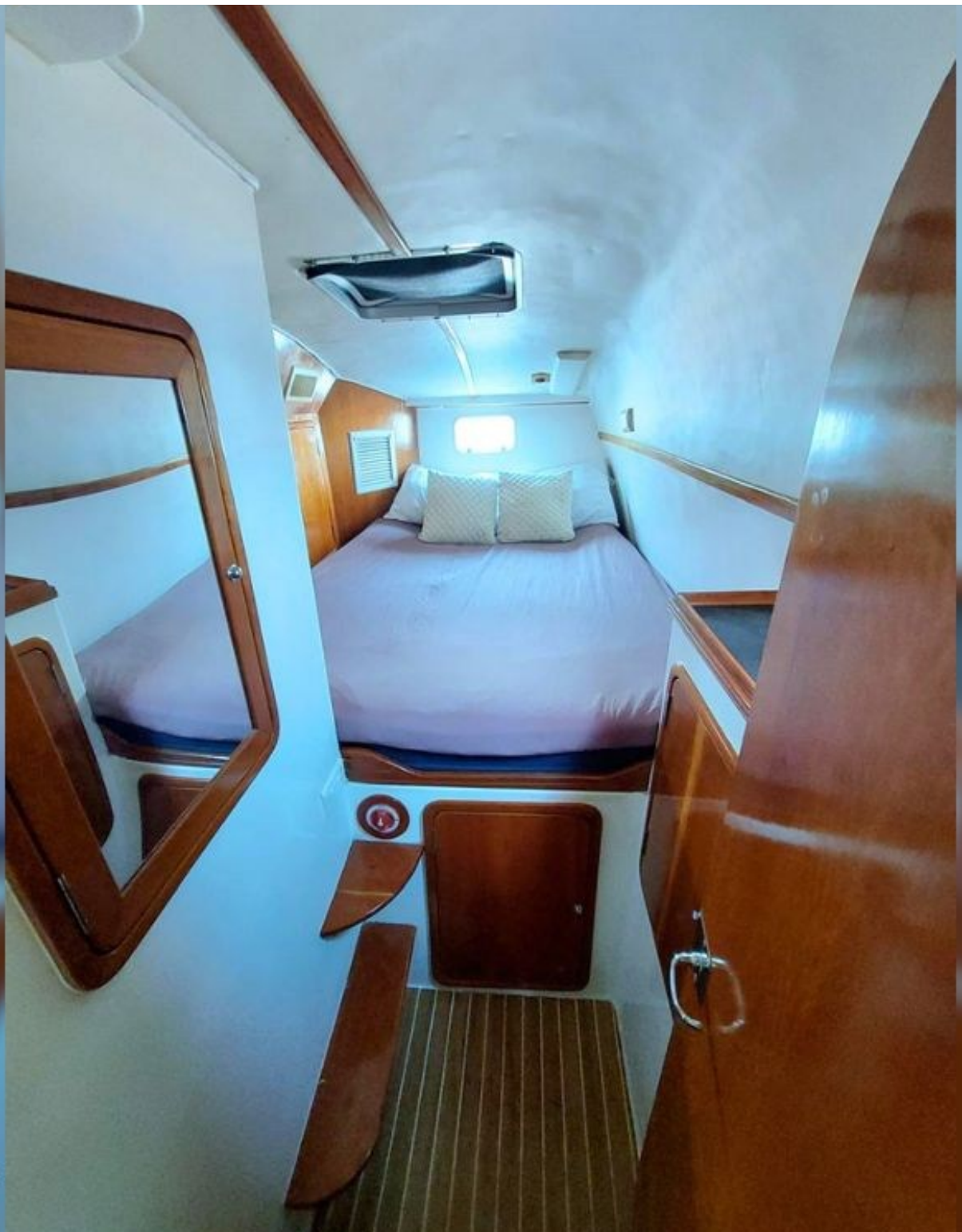
*This is the actual boat.*